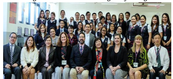
The WASC Visiting Team with the SSIS Batangas and Malarayat campuses' Board Members and Management Committee during the closing meeting at SSIS Marayat, March 08.

Let us sustain our strong teamwork and unity as one Valiant Knights family!